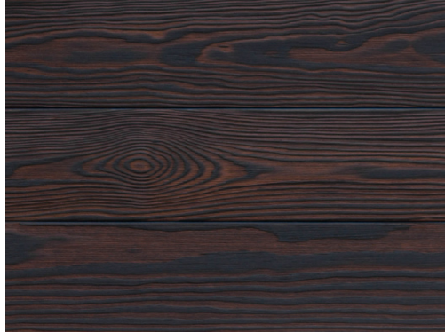
NOBU - KEBONY® WOOD SOLID - SKU #CH-750257