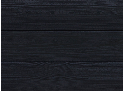
SUPERKÜL - KEBONY® WOOD SOLID - SKU #CH-750318