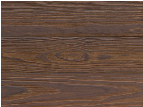
MARKA - KEBONY® WOOD SOLID - SKU #CH-750316