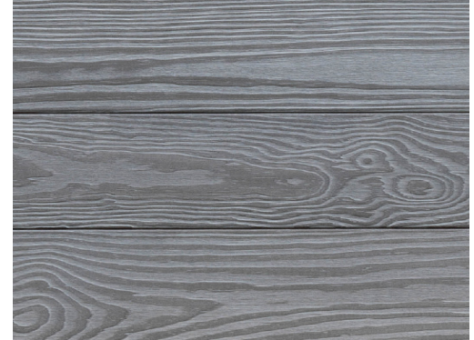
FAEN - KEBONY® WOOD SOLID - SKU #CH-750314